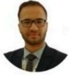
CEO of PHI

"We overcome all obstacles in the way of scientific research"